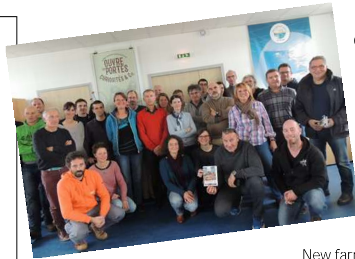
Some examples: Charter of best practices for marine exploration