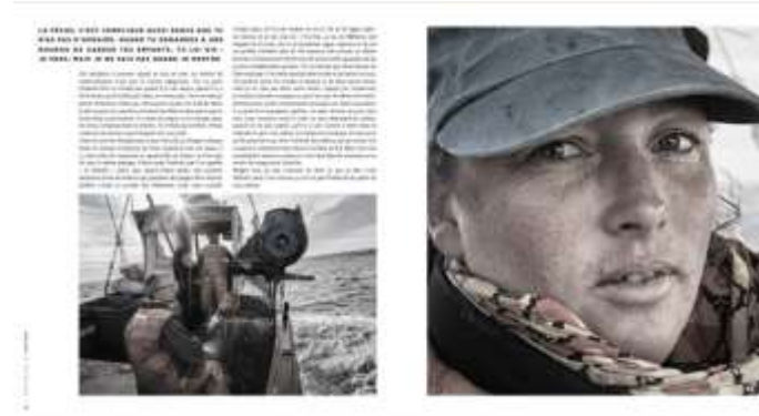
Collection and promotion of the professional fishermen's daily life and stories