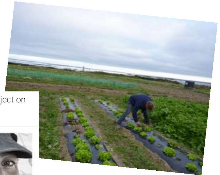
New farming project on island