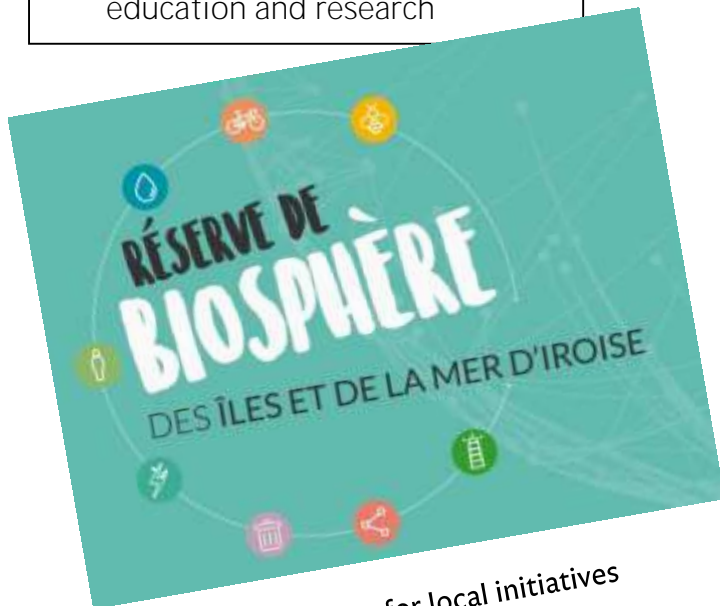
Annual competition for local initiatives