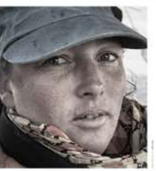
Collection and promotion of the professional fishermen's daily life and stories